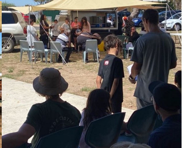
Some photos from a recent gathering at Point Pearce November 27, 2021