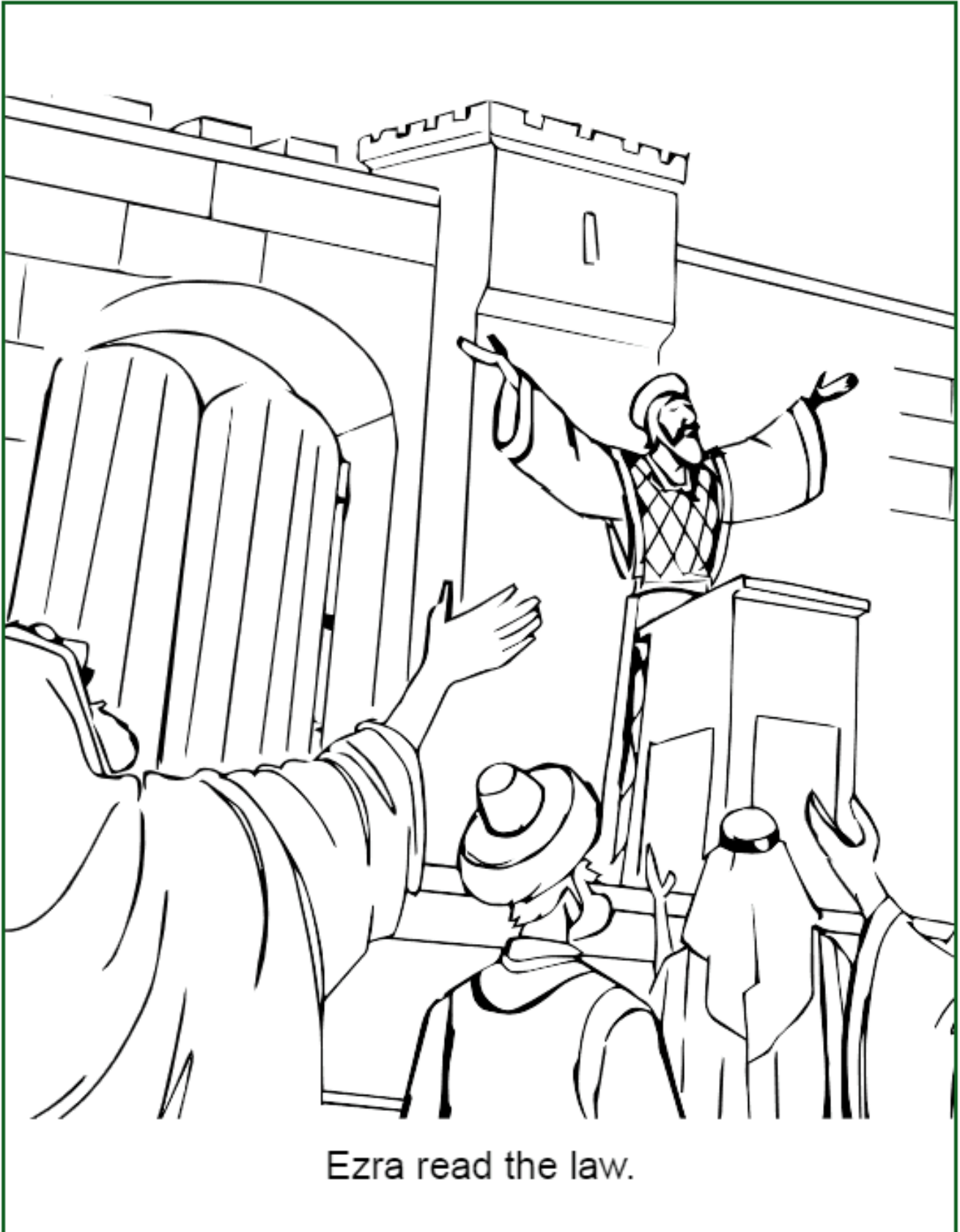
Ezra read the law.