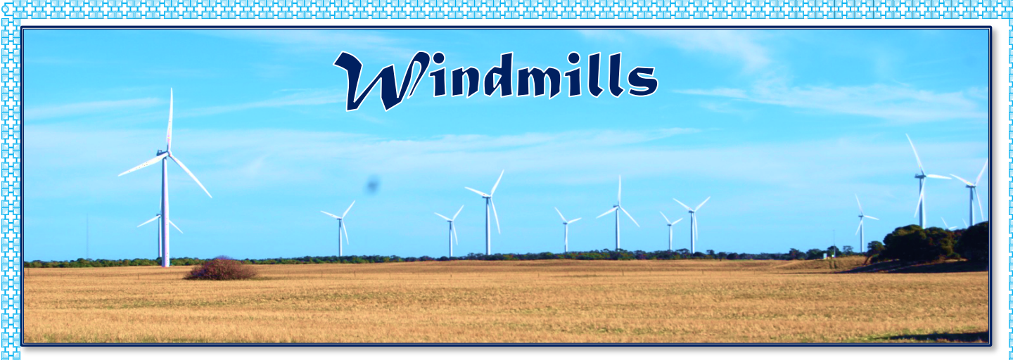
Notes from the Ministry District Priest, Yorke Península