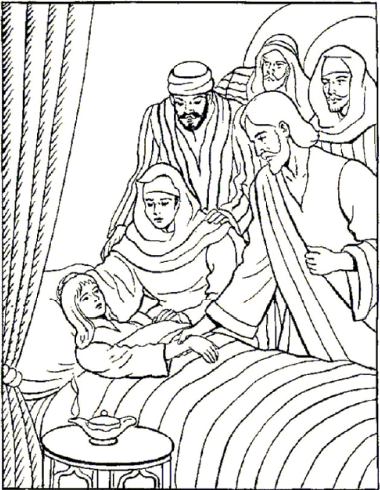
Jesus Raises the daughter of Jairus