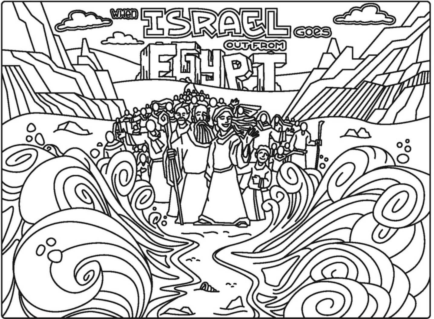
Psalm 114 · illustratedministry.com