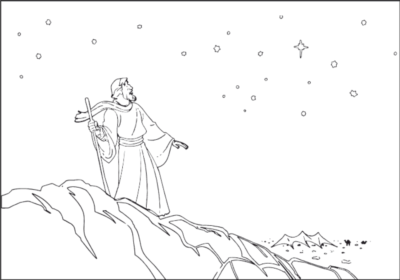
God made a promise to Abraham.