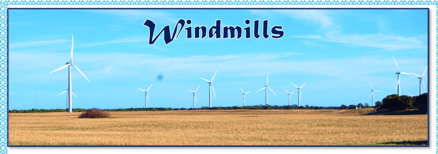
Notes from the Ministry District Priest, Yorke Peninsula